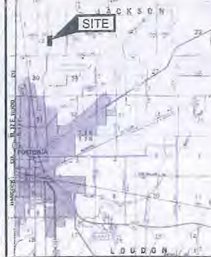
LOCATION MAP SCALE: NONE