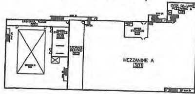
HIRAM MEZZANINE LEVEL (1:2 SCALE)