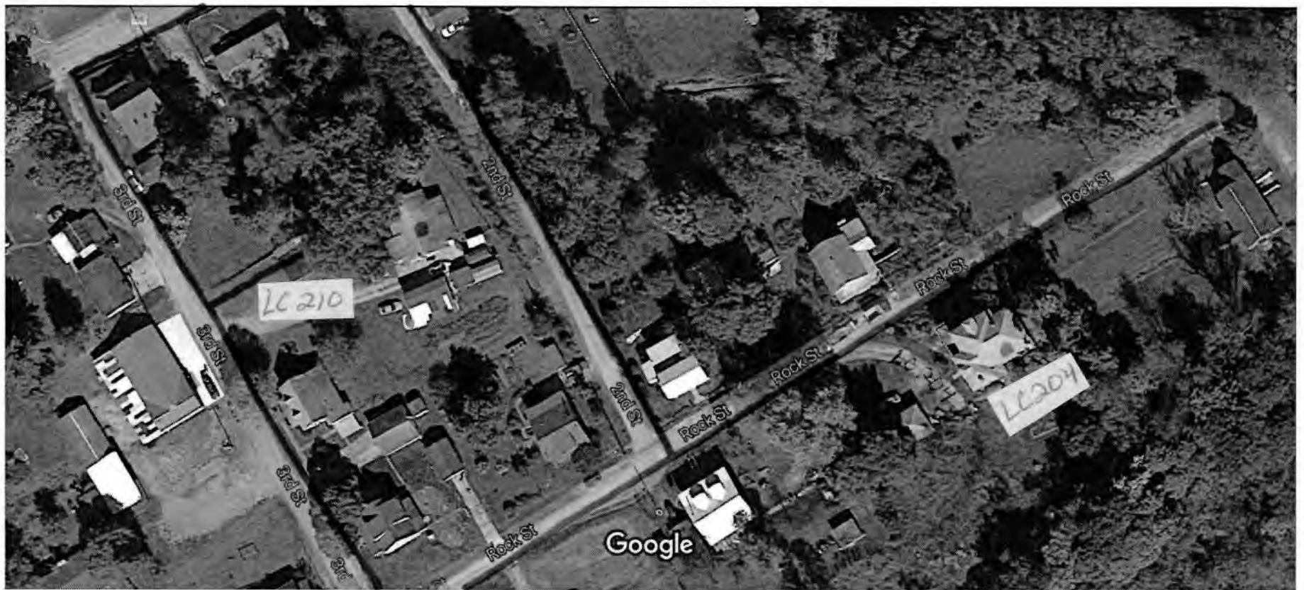
50 ft