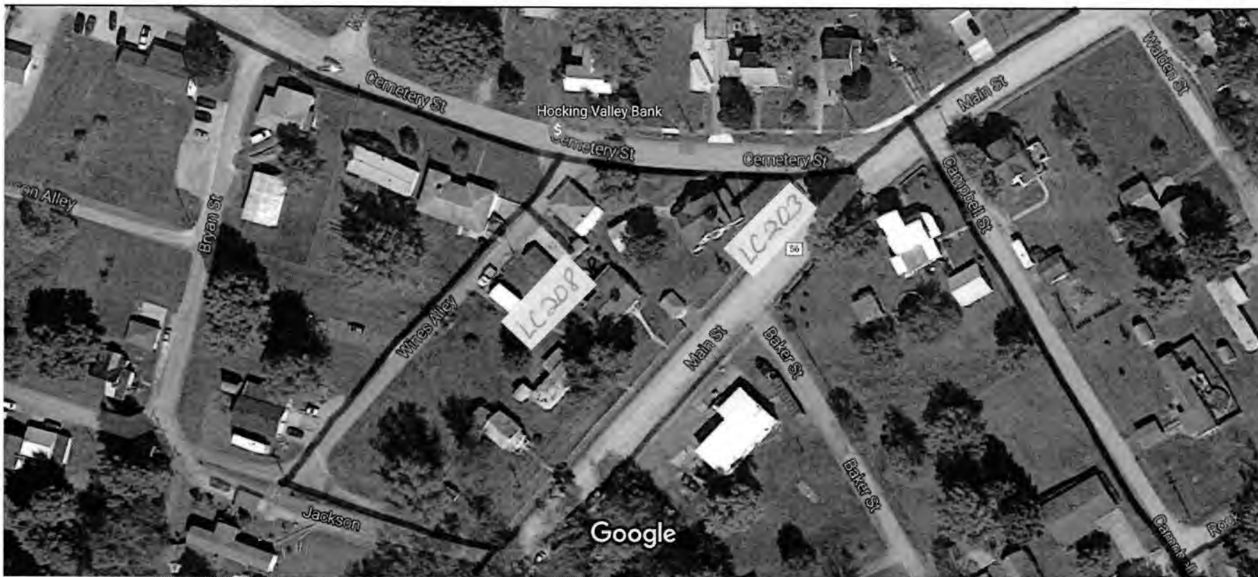
Imagery ©2017 Google, Map data ©2017 Google 100 ft