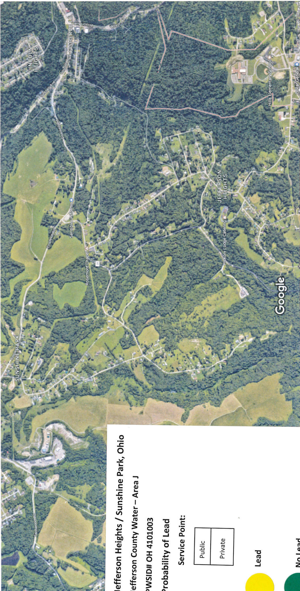
Imagery ©2017 Google, Map data ©2017 Google 500 ft