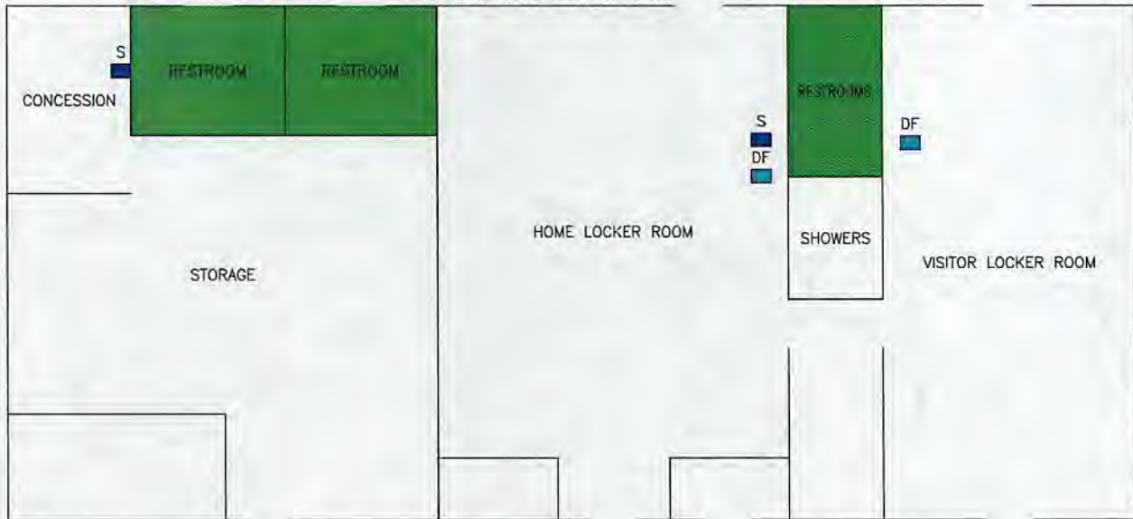
FIELD HOUSE BUILT IN 1988

CLEAR FORK HIGH SCHOOL 987 STATE ROUTE 97 EAST BELLVILLE, OHIO 44813 PHONE # (419) 886-2601 PWS ID # OH7041812