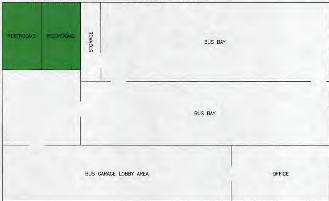
BUS GARAGE BUILT IN 1988

CLEAR FORK HIGH SCHOOL 987 STATE ROUTE 97 EAST BELLVILLE, OHIO 44813 PHONE # (419) 886-2601 PWS ID # OH7041812