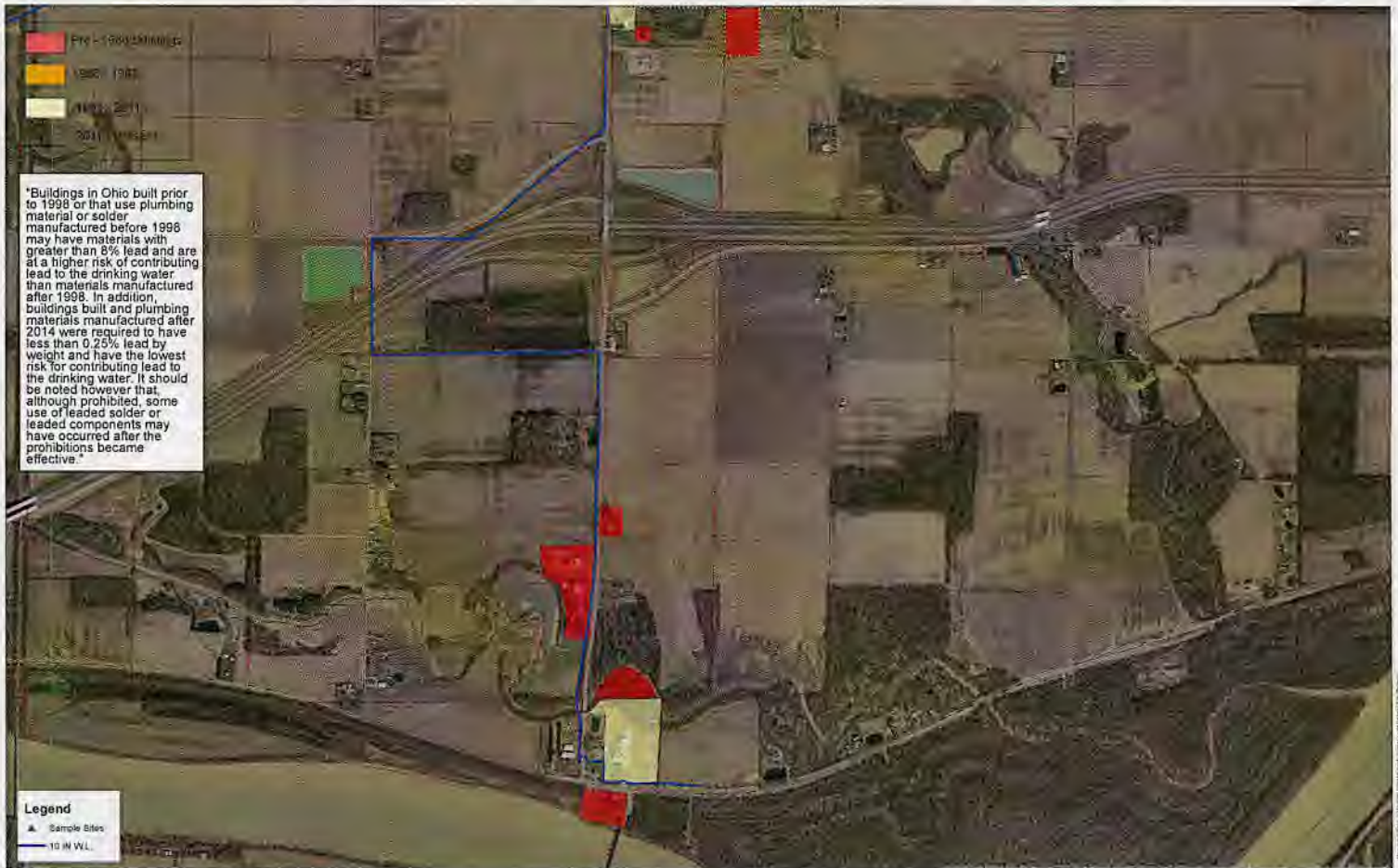
Village of Liberty Center Distribution System Lead & Copper Mapping HB - 512 PWS # OH3500603