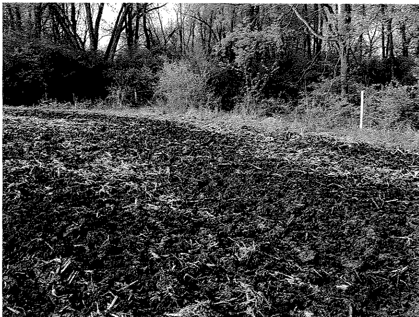
Resolution of Violation #1 (submitted by Renegy)